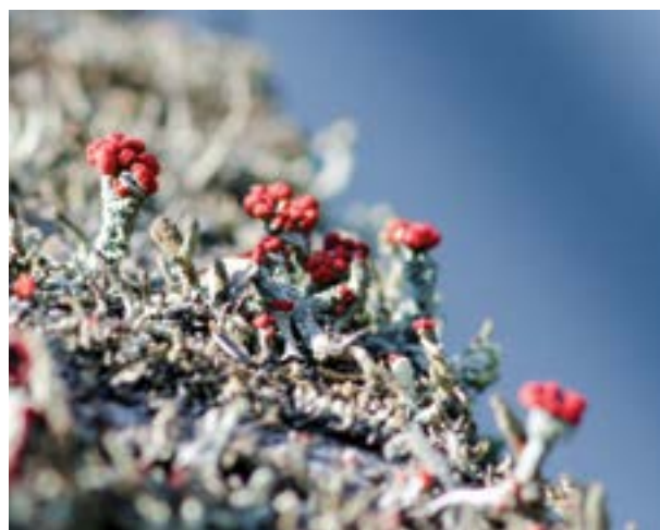
Cladonia cristatella / British Soldier Lichen

* includes one-time bequest gifts of cash and land totaling $1,237,500